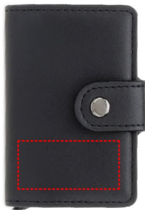
FRONT BOTTOM OF WALLET