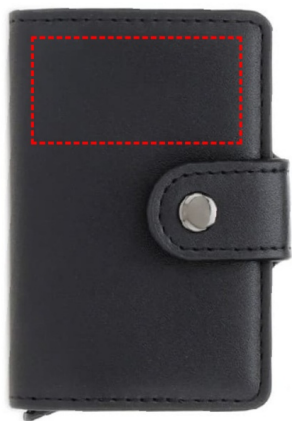
FRONT TOP OF WALLET